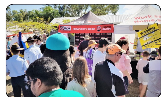
Emergency Services Day Rockhampton