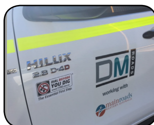
DM Roads with the Dial Before You Dig stickers on display.

DM Roads are using our Dial Before You Dig stickers on their vehicles to help call to mind and promote the importance of safe excavation prior to any project big or small.