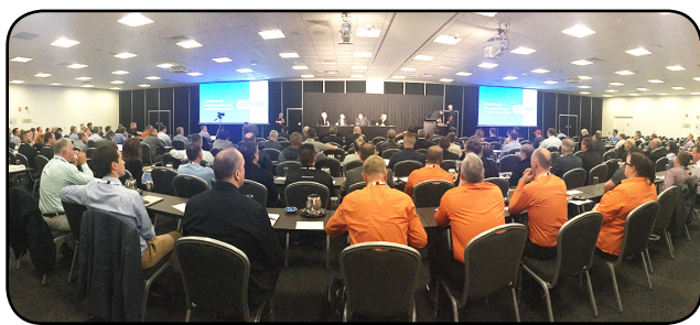
Delegates at the Oceania Damage Prevention Conference