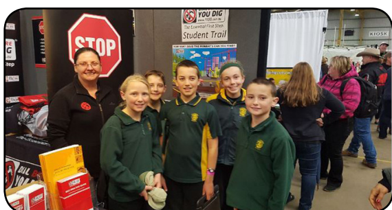
Excited primary school students follow the student trail.

With attendance and sponsorship by the Dial Before You Dig National collective of organisations, the inaugural Oceania Damage Prevention Conference was very successful. With speakers and attendees from all over Australia and overseas, it was a great opportunity to open discussions to further develop the collective approach to damage prevention and safe work education.