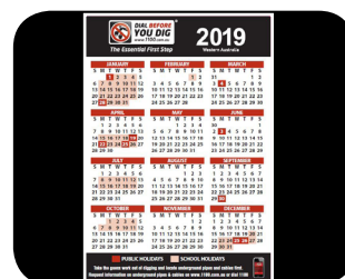
New 2019 calendar available now.

If you are interested in promoting the importance of safe excavation and would like to display the free stickers or other promotional merchandise (subject to availability) please email us at wa@1100.com.au .