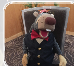
Doug the Wombat even dressed up for the forum.