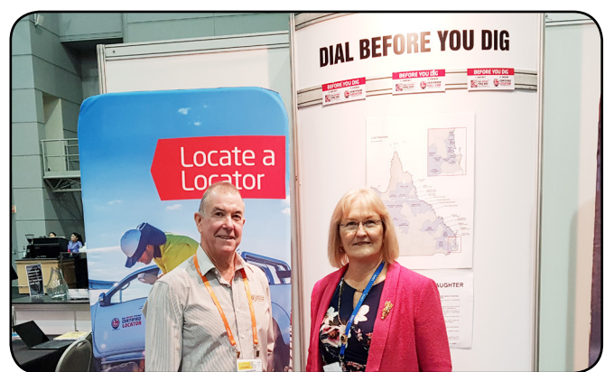
LGAQ State Conference