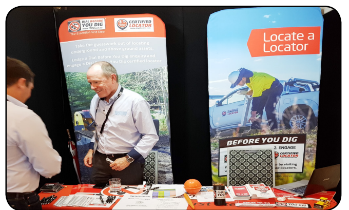
IPWEAQ State Conference

We presented a session at the Queensland Water mini conference in Cloncurry, exhibited at the LGAQ State Conference at the Gold Coast, the IPWEAQ regional conferences and the IPWEAQ State Conference in Brisbane. We use these events as a major avenue to converse with Members and associates about safe digging processes and the Certified Locator program. This allows us to approach asset owners who are not yet members of Dial Before You Dig and discuss the advantages of membership.