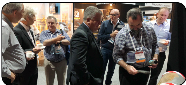
Delegates at the Australian Pipelines and Gas Association

Lastly, on behalf of all the Dial Before You Dig staff, I would like to take this opportunity to thank the Dial Before You Dig community for your ongoing support over the last 12 months. Protecting Australia's infrastructure requires a coordinated effort from the sector and DBYD could not play our part effectively without your continued support. Have a safe and relaxing Christmas and New Year festive period and we look forward to working with you all again in 2019.