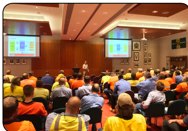
Awareness Presentation to Cairns City Council

Dial Before You Dig Queensland have continued spreading the safe digging message delivering awareness sessions to various organisations, contractors and councils. We also did joint presentations in conjunction with Ergon Energy and Telstra to over 60 participants from Townsville City Council and to over 100 participants from Cairns City Council. The participants came from a number of roles including construction, maintenance, parks and gardens, plumbers, office administration and some subcontractors. The positive feedback we received is encouraging that the safe digging message is getting traction. This should translate to reduced damages to the underground assets of our Members.