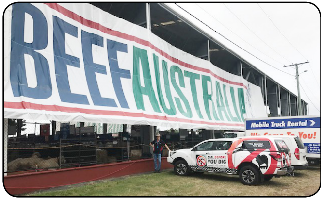
Beef Week in Rockhampton