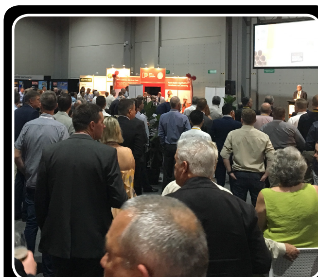
Australian Pipelines and Gas Association 50 th Anniversary

As part of a national initiative, Dial Before You Dig attended the 50 th Anniversary of the Australian Pipelines and Gas Association Conference at the Darwin Convention Centre. The conference was well attended by many industry representatives coming both from the Top End and all over Australia, creating ample opportunity for our national staff to make valuable connections. We were also delighted to host the 'damaged pipeline of the Derwent Park Road, Hobart incident,' drawing a sizeable crowd to the Dial Before You Dig booth.