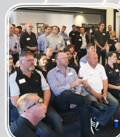
Full house at the WA Forum.